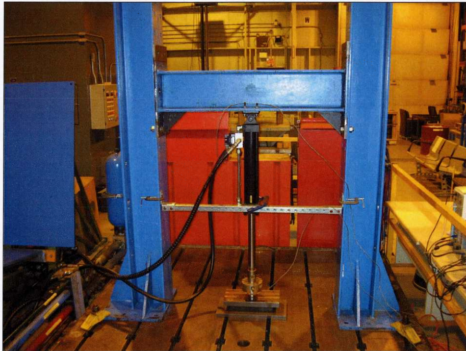
Figure 1 : Compression test set-up – General view