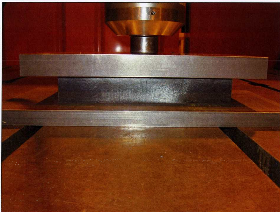
Figure 3 : Compression test set-up – Example of sample installed between fixtures