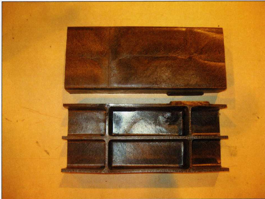
Figure 5 : Shape of mini specimens used as test samples