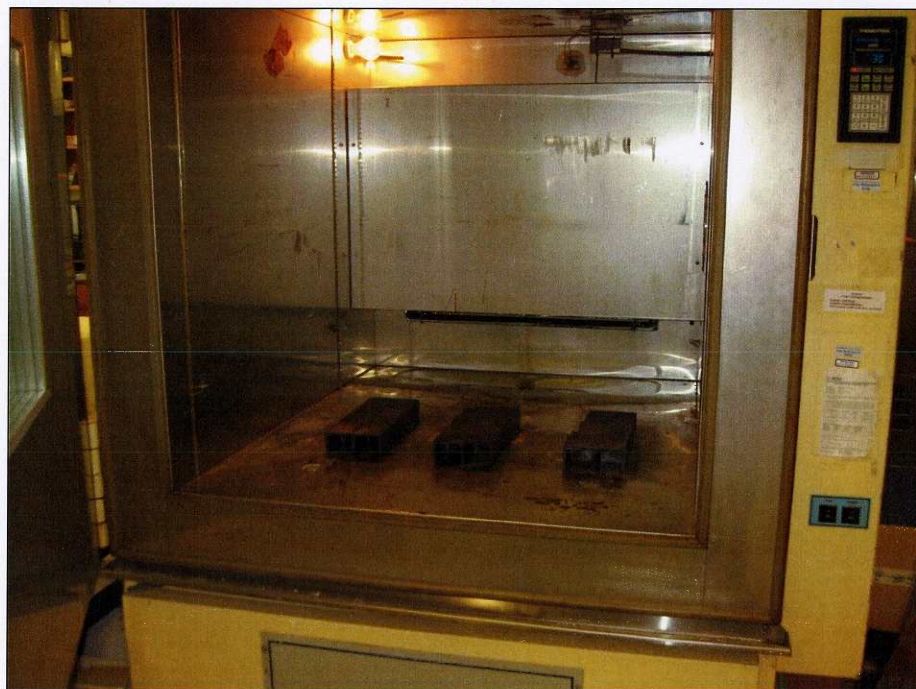
Figure 4 : Example of samples in the environmental chamber